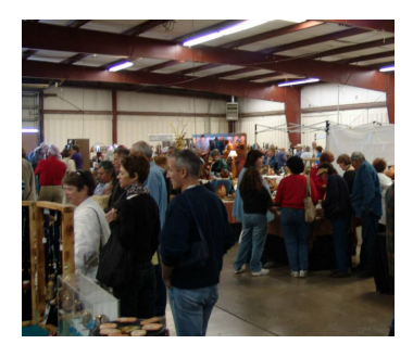
Huge crowds attend the Wuertz festival each year. This event has grown to become one of the largest in the country (and is probably THE largest now!)

The First Gourd Car Races held in 2004. This event has grown and continues to be one of the most popular events at the festival!