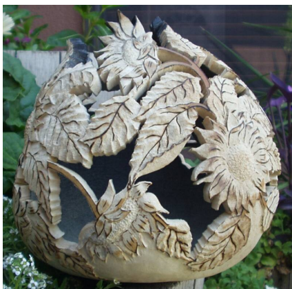
Photo Gallery: Photos of gourds that were done by some of my students. Want to see your work pictured here? If you have taken a class from me in the past and are willing to share your work, please send me a photo and I'll select a few to display when space permits.