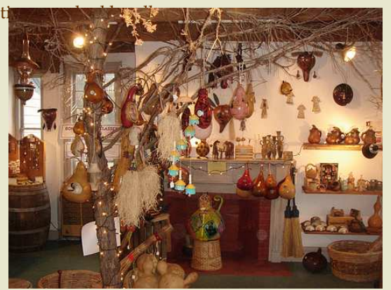
Inside the shop, a tree appears to grow up through the building - it's actually just a great way to display gourd birdhouses!

Devon graciously provided me with the opportunity to travel to her location and teach a weekend of gourd crafting classes. Despite the soggy weather, a fun Right: Devon's