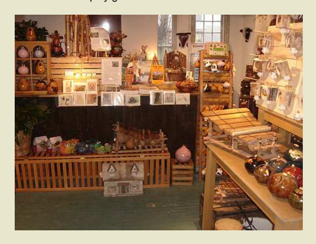
The gourd gallery has a wide variety of gourd objects including masks, ornaments, purses, birdhouses, art vessels, musical instruments and much more. In addition, they carry many other related art objects and a wide selection of Peruvian and World gourd pieces.