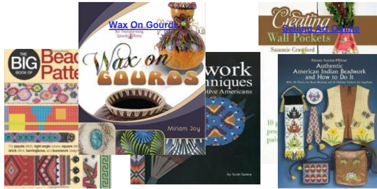
The Everything Guide to Selling Arts & Crafts Online