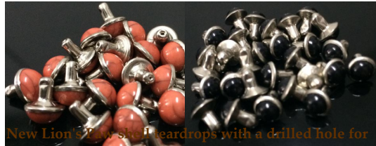
New Lion's Mane shell earrings with a drilled hole for hanging on the Earrings and More Page . Check out the beautiful mask by Kathe Stark using one of these!