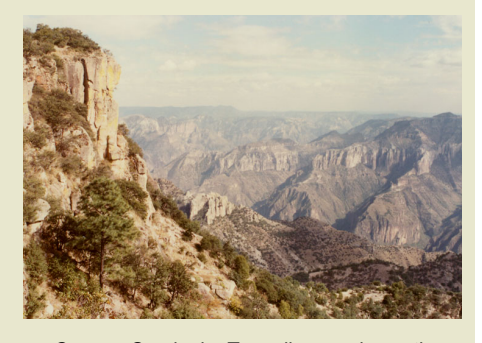
Canyon Overlook. To really experience the canyon you need to spend more time than our trip allowed. Copper Canyon is not as developed as our Grand Canyon, so hiking is the best way to really appreciate much of the area.