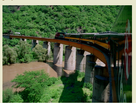
The train ride was fun; we crossed many high bridges and went through over 80 tunnels each way! The landscape varied from desert to ponderosa pine forests.