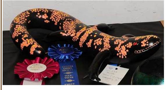
This Gila Monster won best of class in the youth/teen division.