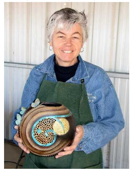
Above: Gourd now in the collection of Gerri Bishop.

3 photos from the Master Craftsman Division. The judges had some very difficult decisions!