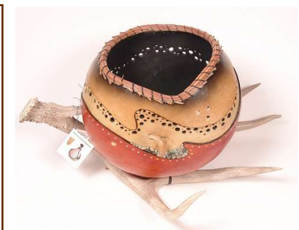
This gourd has been attached by drilling holes in the gourd and lacing it to the antler.

(Elk teeth are available on the Beads and Embellishments page, Sinew, metal cones and leather