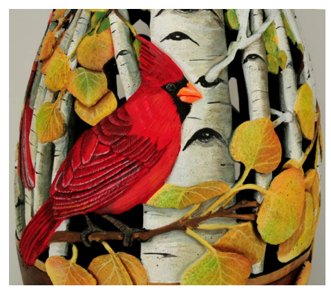
Copyright 2008 - Bonnie Gibson All images and designs on this website, unless otherwise noted, are the property of Bonnie Gibson, and may not be reproduced or copied without permission.