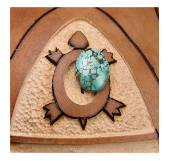
An opening has been created so the cabochon can be glued in very securely.