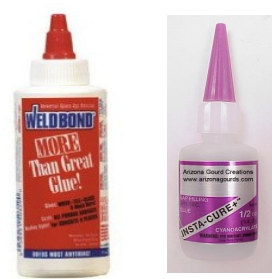
Two adhesives I use.