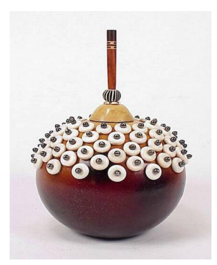
All of these beads are firmly attached. I drilled small holes in the gourd and then inserted heavy pins through the beads and into the holes in the gourd. A bit of gap filling cyanoacrylate glue makes everything extra secure..