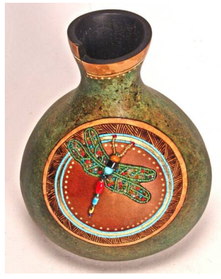
This gourd has an added dragonfly pin.

Overstock Special: My supplier made a mistake and I ended up with an oversupply of <u>beaded dragonfly pins</u>. I'm not able to return these, so I'm offering them at a special discounted price for the month of September. They are available in 6 different colors and all of them are lovely. You can order by color during September while supplies last.